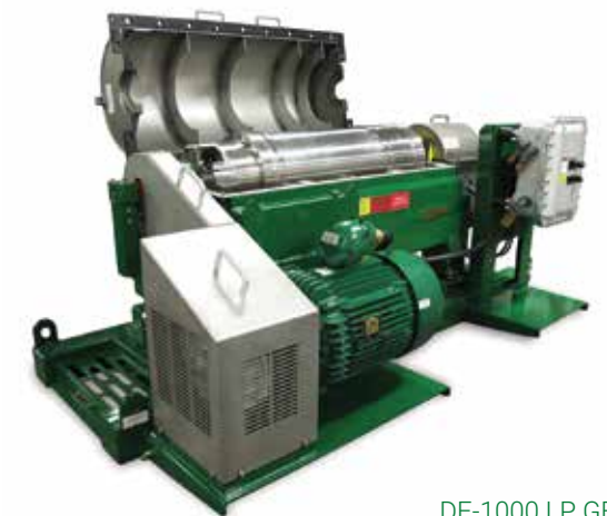
DE-1000 LP GBD