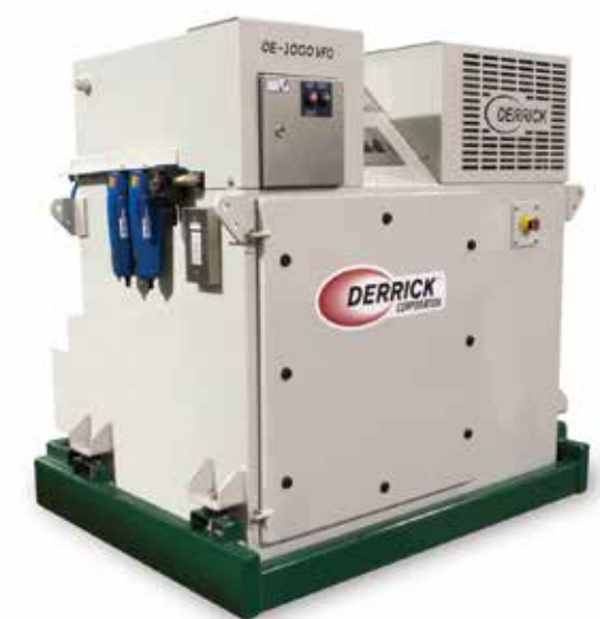
DE-1000 Control Cabinet

FOUR REMOTE MONITOR AND CONTROL OPTIONS PROVIDE FLEXIBILITY FOR DIFFERENT APPLICATIONS AND INSTALLATIONS