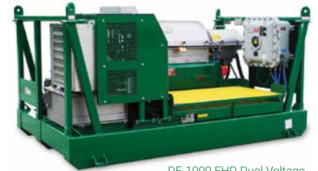
DE-1000 FHD Dual Voltage