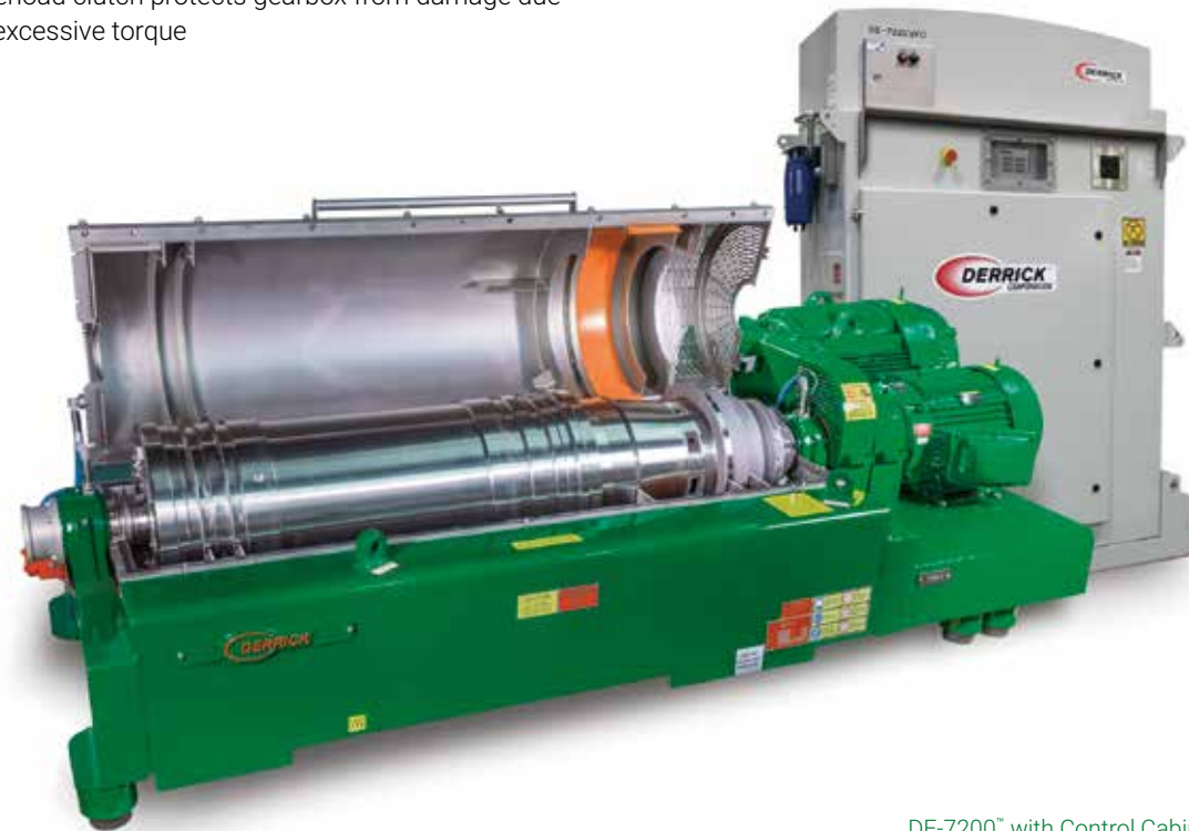
DE-7200™ with Control Cabinet