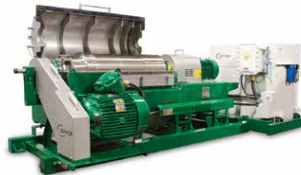
DE-1000 LP VFD Dual Voltage