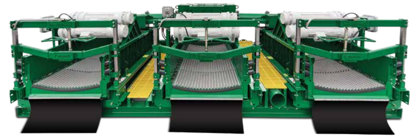
Triple Hyperpool Unit with Integrated Flo-Divider